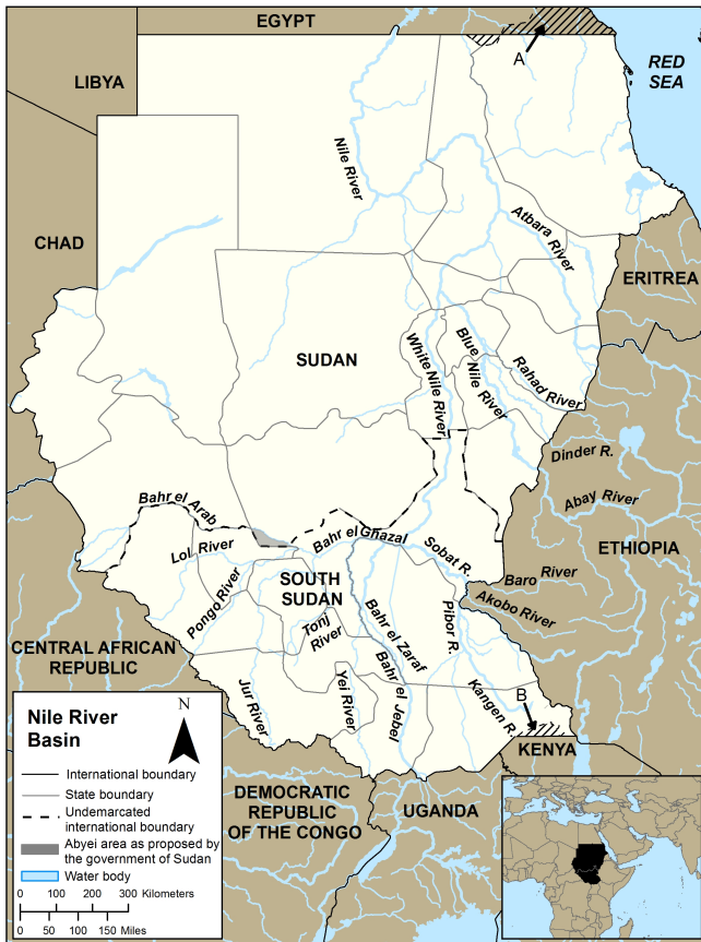
Figure 1. Nile River Basin